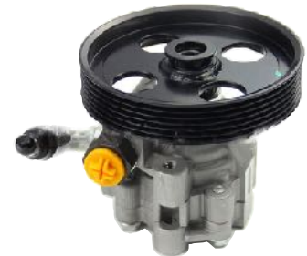
Typical serpentine belt-driven pump design of the early 2000s era