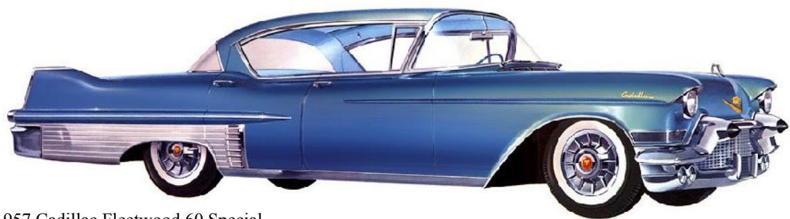
1957 Cadillac Fleetwood 60 Special