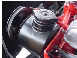
1960 Cadillac power steering pump system