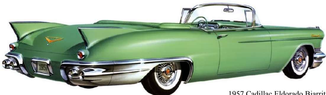
1957 Cadillac Eldorado Biarritz